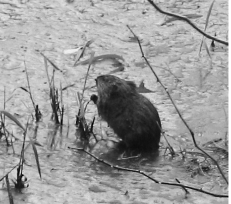
Muskrat seen in Roosevelt Borough May 23, 2010