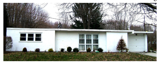
14 Bulletin • April 2021

During our years in Roosevelt, gypsy moths were at their worst and fighting them became a mission to retain some leaves on our trees. And while the deer were nice to see, the little boy across the street Continued on Page 15