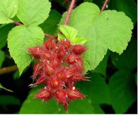
Wineberry - Immature Fruit

As with most invasive species, the key to control is to catch it early, before the plant becomes well established. Short of chemical treatments, wineberries can be controlled by frequent cutting to the ground. Eventually, they die off.