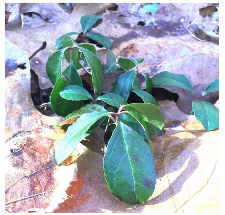
Wintergreen (Gaultheria procumbens) 12 Jan 2022

Wintergreen (Gaultheria procumbens) is a short, spreading evergreen ground-cover. It grows only four to seven inches tall. The plant may spread to cover an area of several square yards. Wintergreen is common in the eastern half of the US, except Florida, and all of eastern Canada. Also called eastern teaberry, it has many other names—unfortunately they are not unique to Gaultheria procumbens, which leads