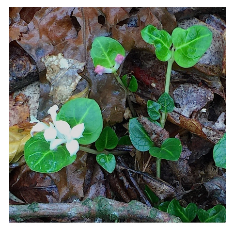
Partridgeberry (Mitchella repens) - 3 Jun 2020

During the winter months most of our native plants become difficult to identify. But there is one that you can easily recognize, the partridgeberry (Mitchella repens). During the winter, this diminutive evergreen creeper is easily recognized by its dark green leaves with pale-green veins and bright red berries. The leaves occur in pairs along the vine. It is usually found in