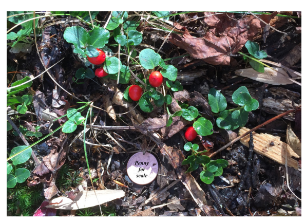
Partridgeberry (Mitchella repens) Ron Filepp Woodland Trail, Roosevelt, NJ - 6 Nov 2021

Partridgeberry (Mitchella repens) makes a great terrarium plant. It is