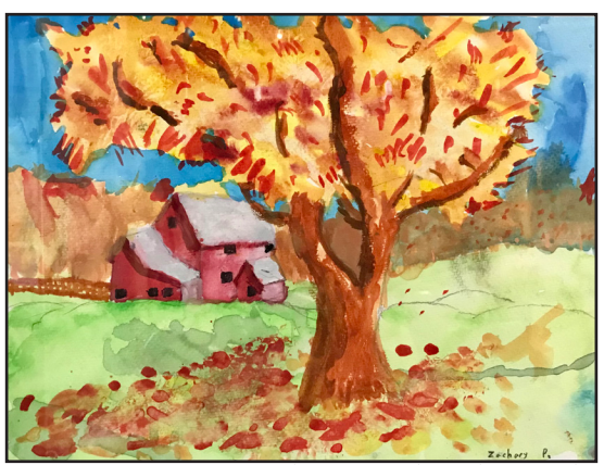
Watercolor on paper by Zachary Pressler

Somewhere the fields are full of larks. Somewhere the land is swinging. My country 'tis of thee I'm singing. Let us arise and go now to the Isle of Manisfree and live the true blue simple life of wisdom and wonderment where all things grow straight up aslant and singing in the yellow sun poppies out of cowpods thinking angels out of turds. I must arise and go now to the Isle of Manisfree way up behind the broken words and woods of Arcady.