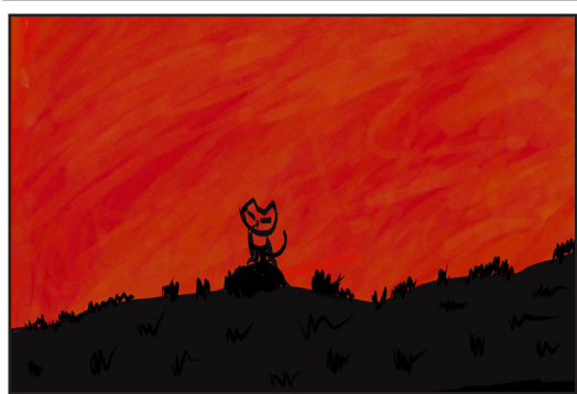
Digital art by Lois Pressler