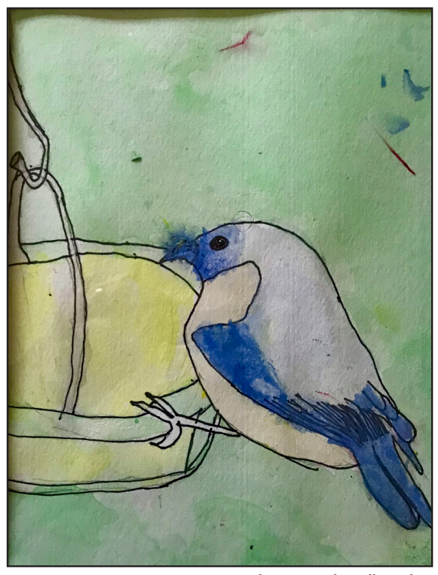
Watercolor on paper by Will Pressler