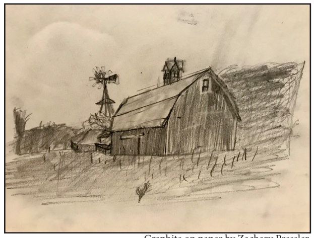
Graphite on paper by Zachary Pressler

Always leave at least 3 feet between your garbage can and recyclable container(s). The arm that lifts the garbage can needs enough room to operate so it can avoid knocking over other containers.