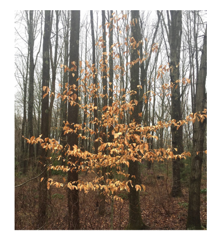
American Beech holding last year's leaves

available to purchase. So enjoy them along the trail.