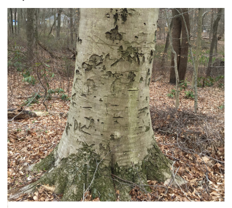
American Beech Trunk

beech, (Fagus grandifolia) is beginning to appear in our woods. Although similar, they are different from the European beech (Fagus sylvatica) frequently found in nurseries. American beech are easily recognized by their smooth silvery grey bark. (Please don't carve initials in the bark; it scars the trees forever and may offer diseases access to the tree.)